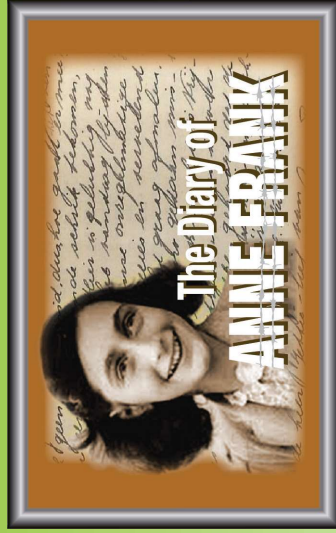
Dramatized by Frances Goodrich and Albert Hackett Based on the book - Anne Frank: The Diary of a Young Girl Edited by Otto Frank

February - 3, 4, 10, 11, 13, 14, 18, 20, 21, 24, 25, 27, 28